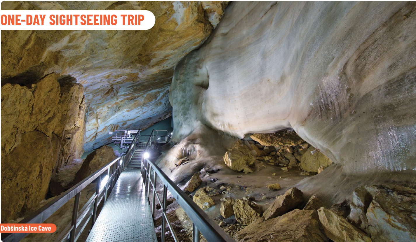
Dobšinská Ice Cave